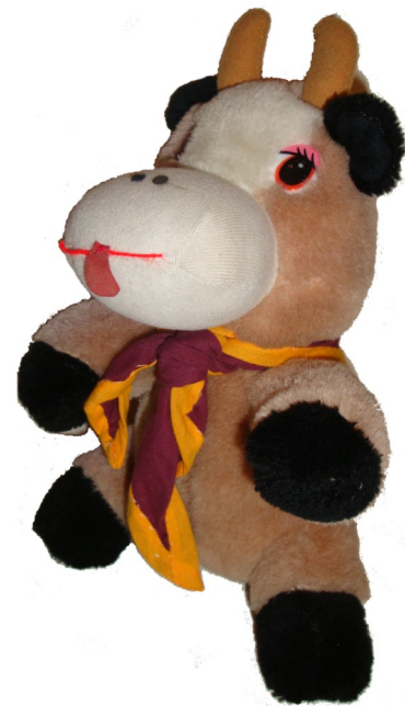
Our Mascot 'Moo'

Parent Scout Website: http://www.scouts.org.uk/parents/